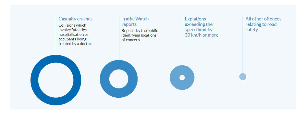
Figure 3: Weighting of South Australia mobile speed camera criteria<sup>122</sup>