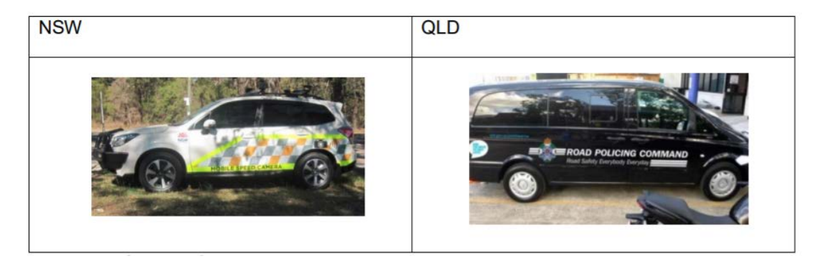
Figure 2: NSW and Queensland mobile speed camera detection vehicles<sup>50</sup>